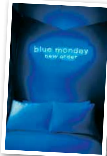
(From top) The facade of new boutique hotel Wanderlust; the Blue Order Pantone Room designed by :phunk Studio; the Mono Deluxe Pop Up Room designed by DP Architects; and the Rusty Typewriter Room designed by fFurious.

For details, visit www.wanderlusthotel.com .