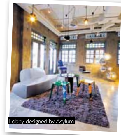
Lobby designed by Asylum